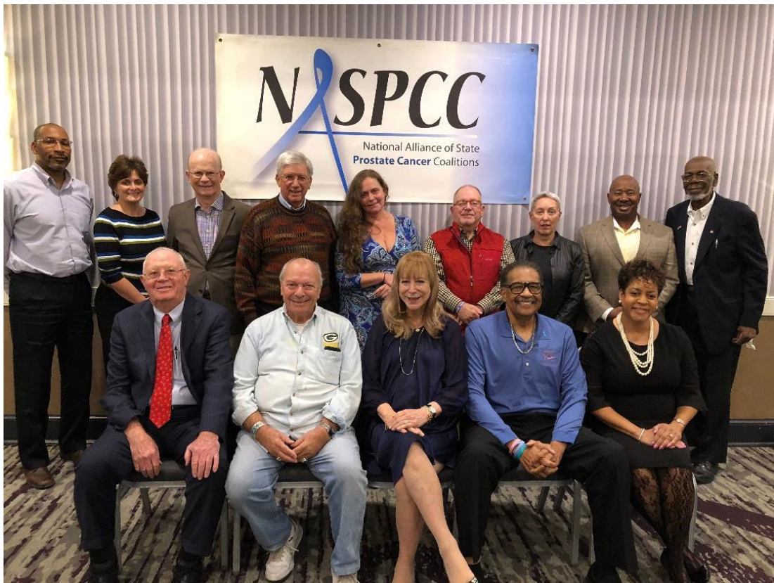
NASPCC Board of Directors, 14 th Annual Meeting, "The More We Know...", October 2018, Washington, DC