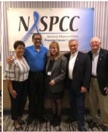
2018/2019 NASPCC Board of Directors and Executive Committee Members